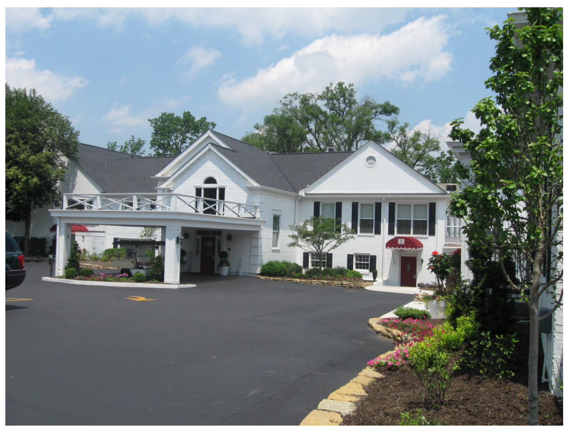
Terrace Park Country Club, Milford OH, 2009