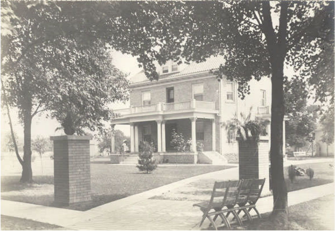
219 Oxford Avenue in 1912