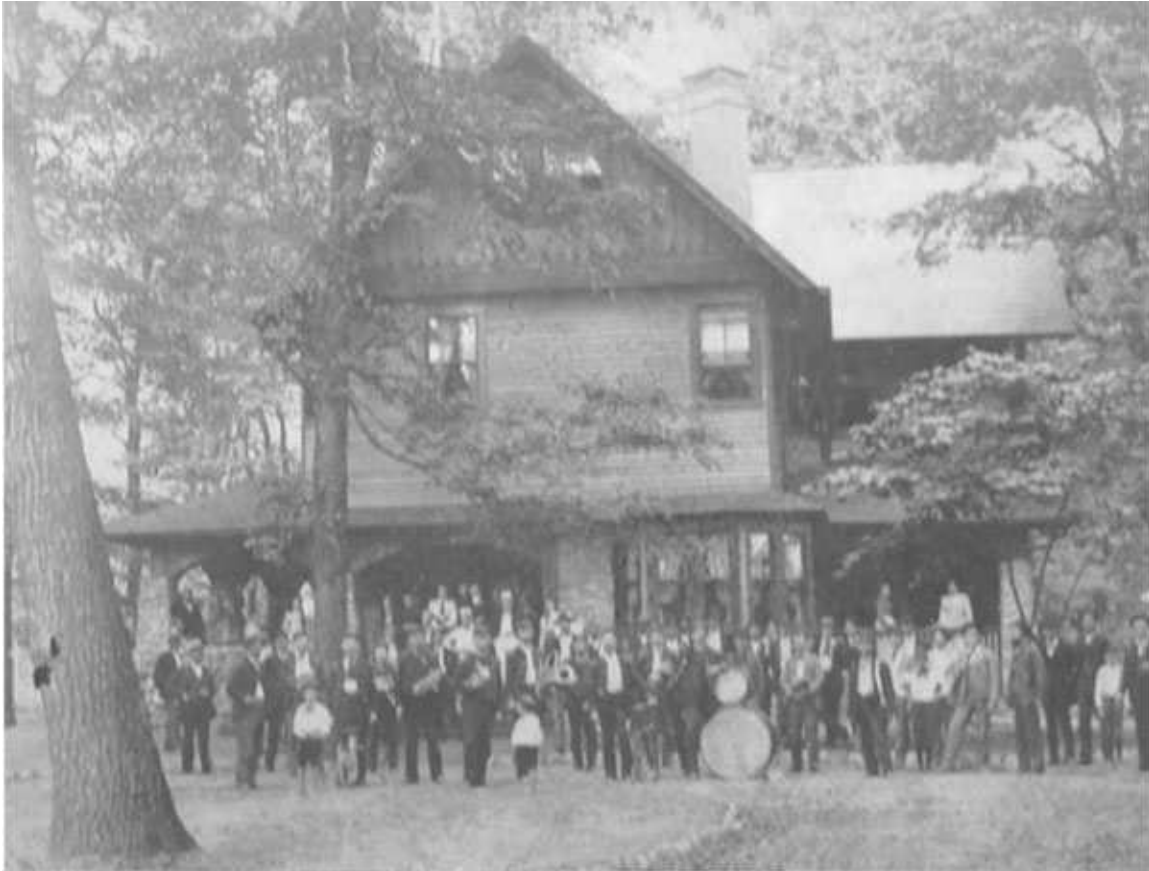
Band entertainment at the Irwin's Rock House Lodge