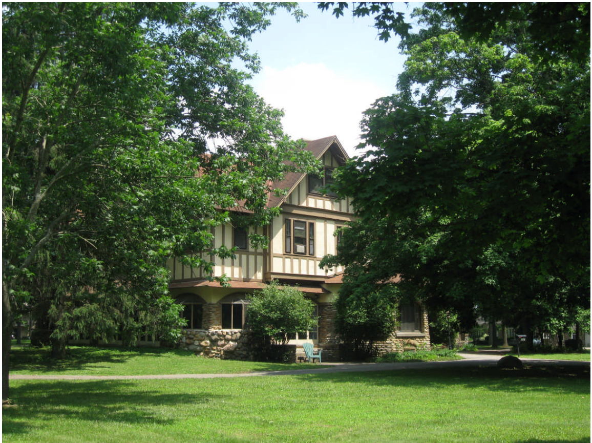
Left front of Rock House Lodge – 2009